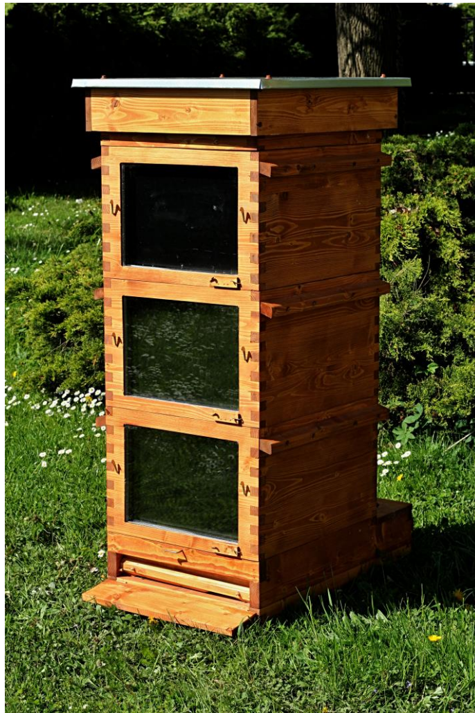
Fig 1: Thermosolar hive

The therapeutic equipment that was tested on its efficiency in exterminating the mites was Linhart's thermosolar hive (Fig. 1). It is a classic multiple-storey hive that is structurally adapted for the transformation of energy from sunlight into thermal energy. The brood chamber is heated by means of two heating systems that permit temperature regulation. The first system consists of a glass thermosolar ceiling that is activated by removal of the roof cover. After reaching a temperature of 47 °C, a hive roof is mounted to prevent further heating. The ceiling includes two temperature sensors that are introduced into the wax of the middle brood comb prior to the treatment and enable control on interior temperature. The second heating system consists of glass thermosolar windows. These are exposed with the possibility of being covered in the case of elevated ambient temperatures. The dimensions of the frames are 39 x 24 cm, which represents the most common frame size used in the Czech Republic.