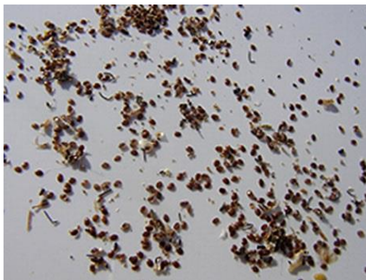
Fig 2: Sample fallout of mites from insulators

Thermotherapy was observed to be highly effective in exterminating mites on sealed brood (Fig. 2). While mite fallout after thermotherapy was considerable, it was only incidental following fumigation (Graph 1).